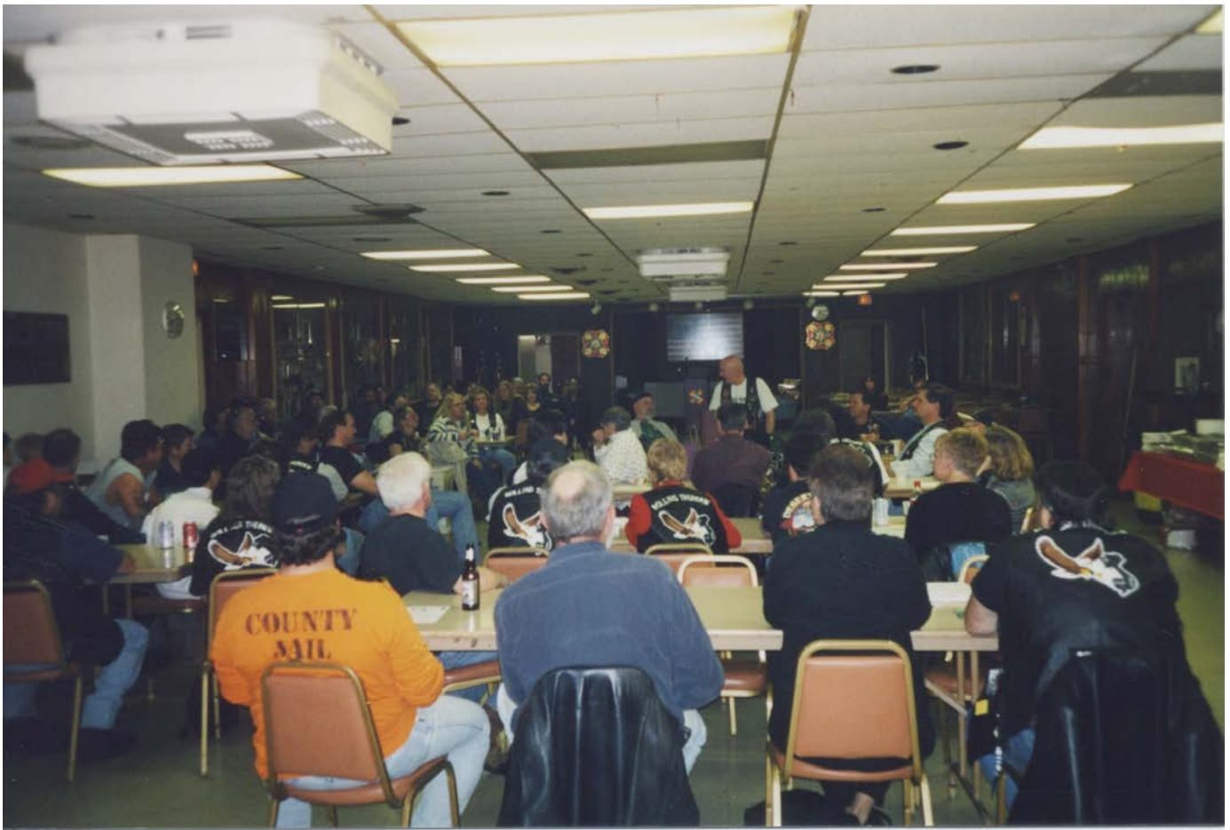
Rolling Thunder® Chapter #1 Meeting - Dec 2001