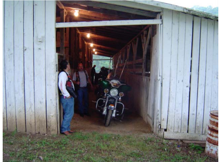
Hotel "Owingsville" Kentucky 2004