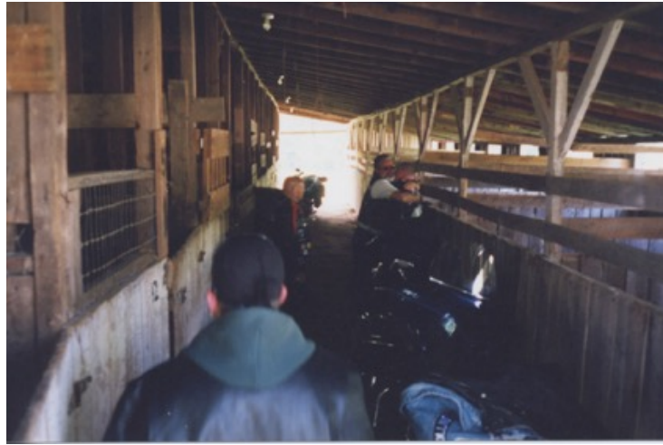
Hotel "Owingsville" Kentucky (2001)