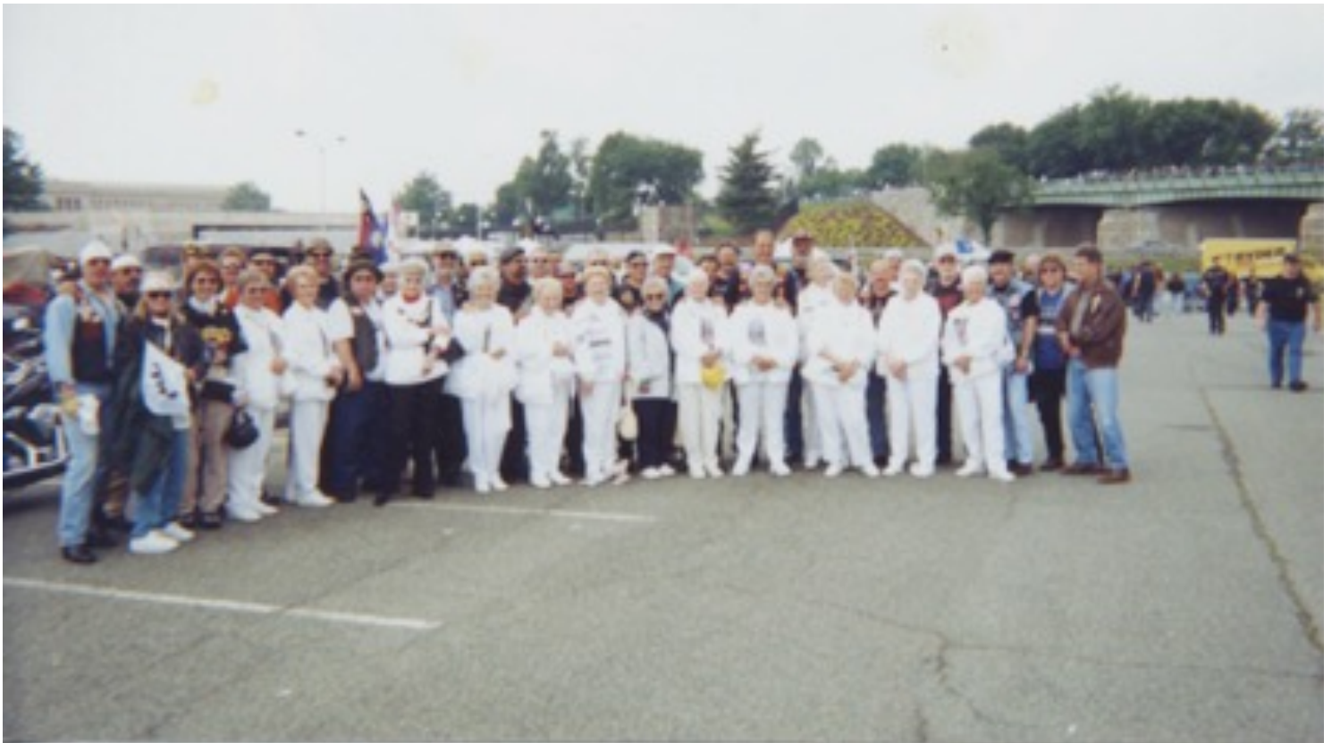
Chapter #1 with Gold Star Moms in Washington D.C. - 2001