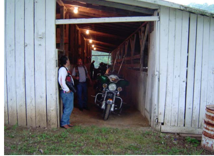
Hotel "Owingsville" Kentucky 2004