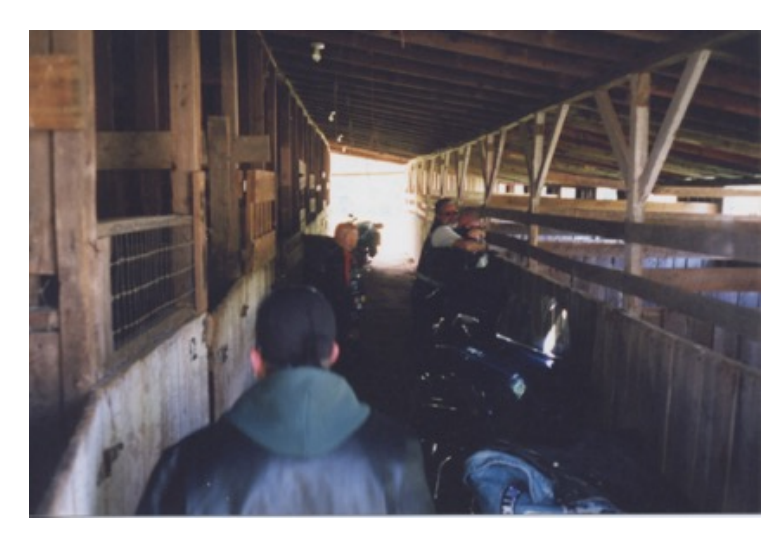
Hotel "Owingsville" Kentucky (2001)